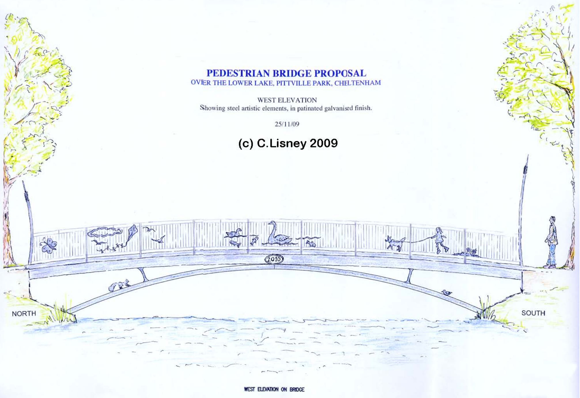
WEST ELEVATION ON BRIDGE